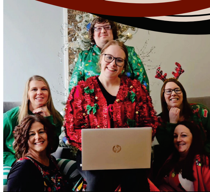
Happy New Year! - the Operations Group

Feel like Christmas arrived before you were ready? Get ahead of next year's holiday costs with a Christmas Club Savings Account! You'll receive your funds before the Holiday Rush. Start your 2026 Holiday Planning today.